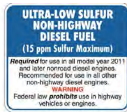
EPA 40 CFR 80.572(b) and 80.573(a)